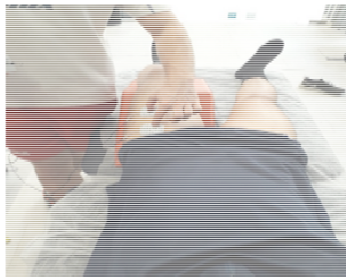
Figure 1. Electrode positioning during measurement by TMG

Notes: M = muscle; Ti = time; TixM = time–muscle interaction; p = value p ; \eta_p^2 = partial eta square All values in ms, except Dm, which is provided in mm, and VC, which is in \text{mm}\cdot\text{s}^{-1} .