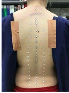
Figure 1. An example of the intersegmental spine kinematic marker set-up. The middle column was placed over spinous processes from vertebral levels C7 to S1, while the lateral columns were situated laterally by 3 to 5 cm over the apex of the erector spinae musculature.