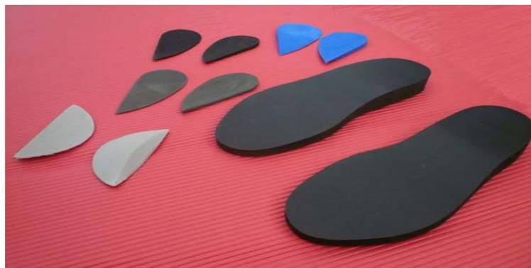
Figure 1 Neutral Zone Prescription Platform (NZPP), consisting of 10mm shoe pitch platforms, foam arch supports and medial rearfoot wedges of varying degrees

Participants undertook a minimum of three practice squats prior to recording in each condition in order to become familiar with the task and equipment. Kinematic data was recorded for three bilateral squats under each condition: barefoot (BFT), standing on the 10mm shoe pitch platform only (PLT), and corrected stance on the platform in the subtalar neutral position with arch supports and medial rearfoot wedges in place (COR) (Figure 2). Trials were conducted in this order for all participants.